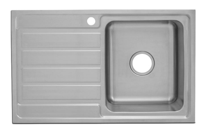
Right Hand Bowl Available in Left HandBowl